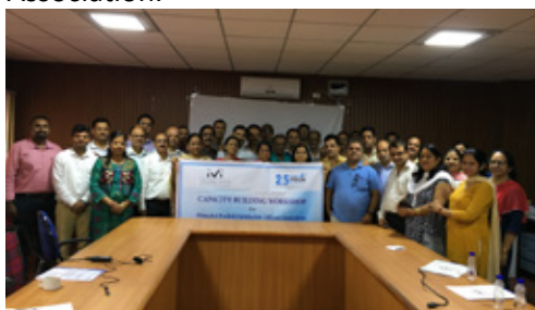
IVI acknowledges the support of 2.5 New Vision Generation India Pvt. Ltd. for funding the program.