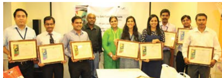
The fourth batch of YLP participants with their certificates