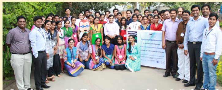
Participants and facilitators at the workshop in Hyderabad

IVI acknowledges the support of Brien Holden Vision Institute Foundation and Optometry Giving Sight in funding the program