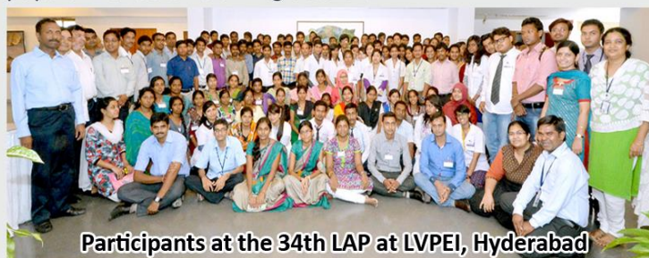
Participants at the 34th LAP at LVPEI, Hyderabad

The program was telecast live through video-conference across the LVPEI network: Kode Venkatadri Chowdary Campus, Vijayawada; GMR Varalakshmi Campus, Visakhapatnam; and LVPEI Bhubaneswar Campus. The participants appreciated the case discussions and the ever popular hands-on training session.