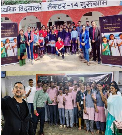
IVI acknowledges the support of AAPC India Hotel Management Private Limited.

A vision screening campaign supported by Accor India to screen and provide free spectacles for children in Chennai and Delhi, undertaken in September, has screened 16,407 individuals. Around 1,000 children were diagnosed with refractive error and the spectacles were distributed in November in the presence of the Accor Management Team.